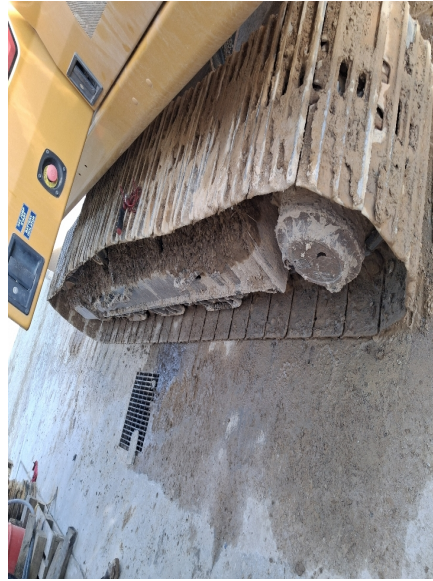
Tyre Condition 1